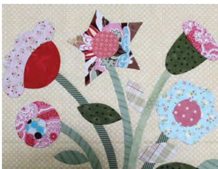
119, 410 | I Can't Believe It's Machine Appliqué | Carmen Geddes

Student Supply List: ½ yard of pre-quilted fabric, invisible thread, regular sewing thread, fabric marking pen, basic sewing supplies, rotary cutter and mat (there will be a few to share).