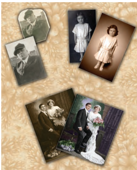
224 | Photos on Fabric—Photo Editing for Photos & Making Quilt Labels, Using Elements or Photoshop | Vicki Shetter

Learn to select photos for transfer, select complimentary fabrics and design a layout along with simple editing techniques.