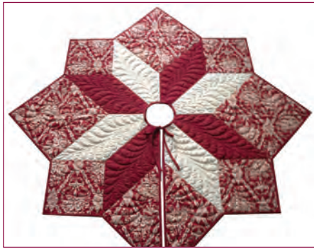
126 | Star Medallion Tree Skirt | Deonn Stott

Kit fee includes pattern and Quilt-in-a-Day's Triangle Square-Up ruler.