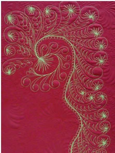
301 | Whimsical & Funky Feathers | Irena Bluhm

Student Supply List: Drawing pad (no lines or grids), pencils, pins, and thread scissors.