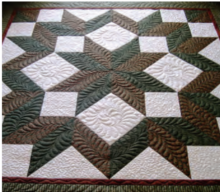
225 | Carpenter's Star | Deonn Stott

Student Supply List: 1 yd print background, 1/3 yd each of 2 coordinating prints for center star. Additional Supplies/Cut List sent with registration.