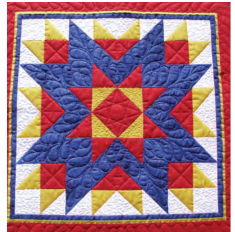
226 | A Soldier's Star | Deonn Stott

Kit fee includes pattern and Quilt-in-a-Day's Triangle Square-Up ruler.