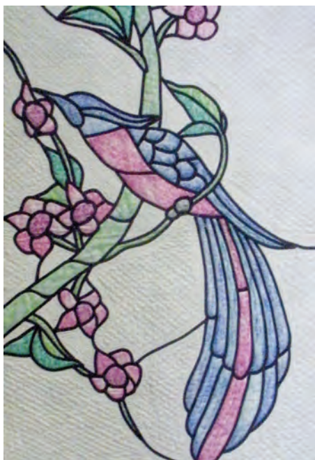
405 | Instant Stained Glass Quilts | Bobbie Bergquist