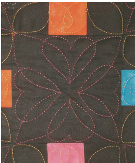
304 | Quilting Inside the Lines | Pam Clarke

Student Supply List: Small iron and thread clippers.