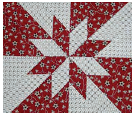
308 | Hunter's Star | Carmen Geddes

Student Supply List: ½ yd or one fat quarter of good muslin or light background fabric, selection of small (fat quarters work well) for floral motif; flowers, stems, leaves, marking pencil or pen (air or water soluble works well, stapler and staple remover, pencil for tracing, sewing thread to match background fabric, clear monofilament thread from Sulky or Superior.