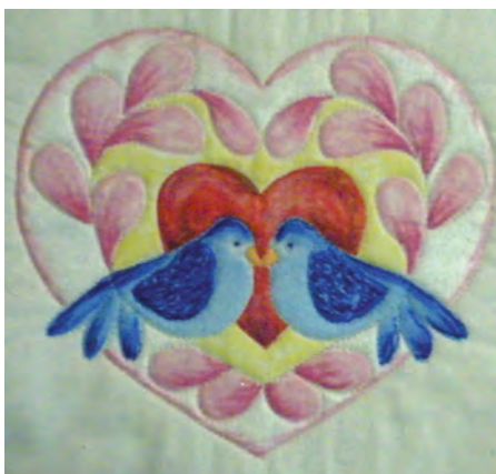
203 | How to Color Quilts After They are Quilted | Bobbie Bergquist

Student Supply List: Wear old clothing. Bring latex gloves if you don't want to get ink on your hands. (Ink is water based and cleans up with soap & water.) 1 large Ziploc bag to transport block, trash bag, toothpicks, paper towels, can of shaving cream (lightly or unscented if possible, Dollar Store works best) plastic coffee stirrer from fast food restaurant, popsicle stick or similar tool, small paintbrushes, (small straight flat cut work well) or any other tool you would like to experiment with.