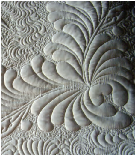
420 | The Art of Good Backfill | Judy Woodworth

Student Supply List: A notebook and pens/pencils to draw along with Judy on several of the demonstrations.